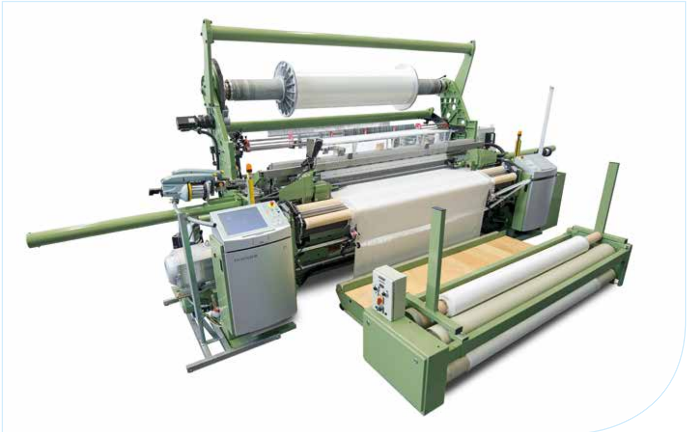
DORNIER P1 rapier weaving machine for multiaxial weaving

Multiaxial weaving allows integrating new or additional functions in fabrics. These can be additional reinforcing or also strip conductors for sensor technology etc. Very differing materials such as polyamide, polyester, glass, carbon, metal etc. can be used for threads in the basic fabric as well as for multiaxial threads.