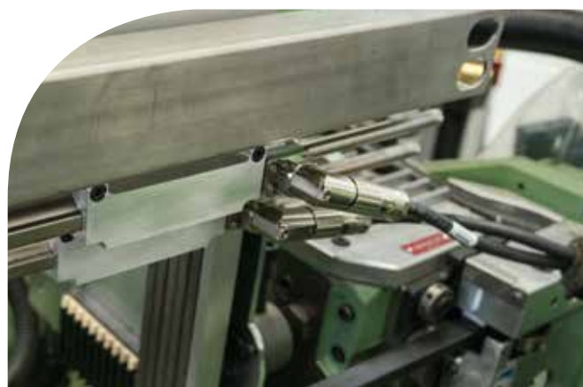
Linear motors for sideways displacement of the additional thread systems

The number of binding points is controlled via the shaft movement. The pattern threads can be controlled freely within certain limits using a lifting plan and the fabric structures created can be reproduced.