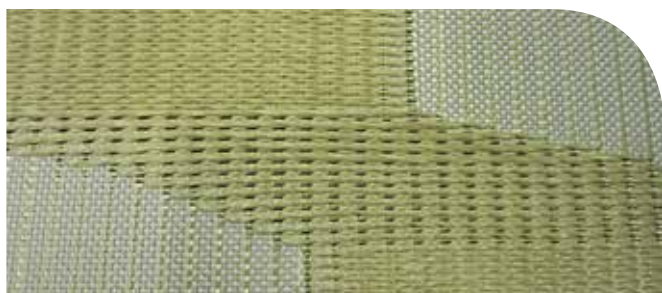
Fabric with partial reinforcement

The DORNIER ORW technology contributes to the development of new, innovative products. Product applications range from partial reinforcement to weaving in functions in connection with strip conductors and on up to functional textiles in the footwear sector. This opens up developing new functionality within fabrics.