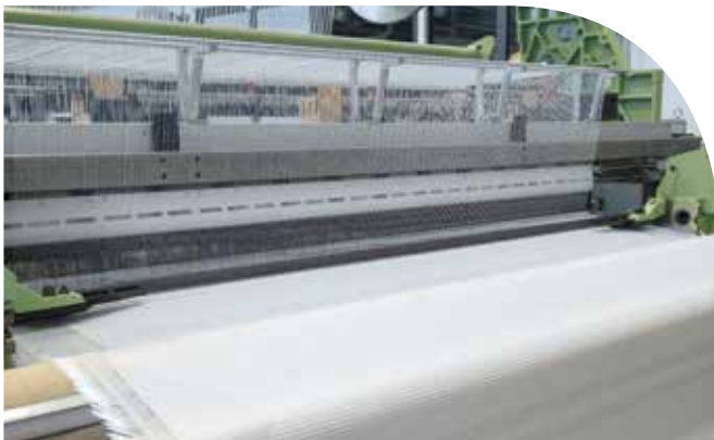
Multiaxial fabric with two additional thread systems